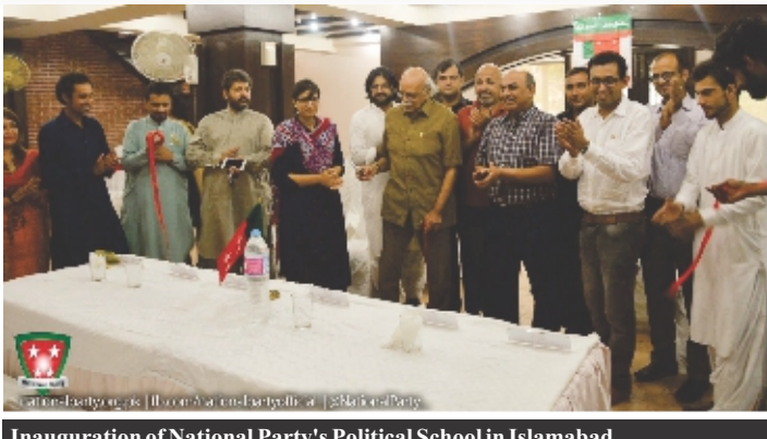
Inauguration of National Party's Political School in Islamabad

The consultation process behind the decision is unknown and most probably would have resulted after a decision of the top party leadership.