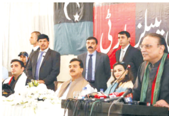
The former President of Pakistan, Mr. Asif Ali Zardari delivering his fiery speech on June 16, 2015. Mr. Zardari left Pakistan shortly after the speech on June 24, 2015 and has been abroad since

Perhaps one of the key defining moments for the relations between the Pakistan Peoples Party (PPP) and the Military leadership for the period under consideration was the broadside fired by the former President, Mr. Asif Ali Zardari, in our opinion absolutely unnecessary and imbalanced, on June 16, 2016 openly criticizing the Military for ' stepping out of its domain '. 27