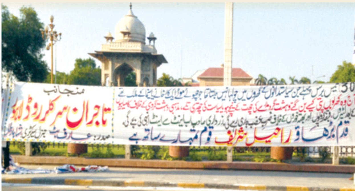
The banner, courtesy of the Traders of Circular Road, Lahore, is displayed at the Charing Cross, outside of the Provincial Assembly of the Punjab building (seen in the background)