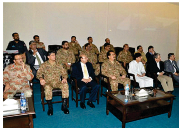
Civil-Military leadership attending a briefing on the Karachi Operation at the Corp V Headquarter on June 26, 2016

While Pakistan Rangers (Sindh) is taking the lead of the