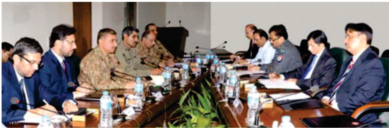
Meeting of the Joint Operation Coordination Committee, Punjab was held in Lahore on April 09, 2016

The month of April 2016, however, saw several initiatives being undertaken to overcome the apparent cleavage with regards to the Punjab operation with official consultations taking place between the Chief Minister of the Punjab, the Federal Minister for Interior, the Prime Minister and the COAS. Subsequently, as of April 09, 2016, a Joint Operations Coordination Committee for Punjab has been formed to oversee the operation. Although the terms of reference, periodicity of meetings, and membership of the forum remain unclear, it apparently comprises ' senior civil and military officials of Punjab '. 55