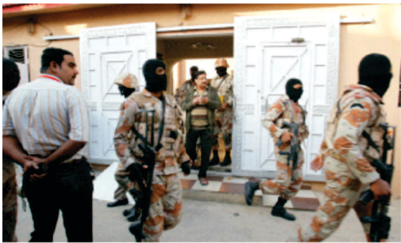
Picture showing the Pakistan Rangers (Sindh) conducting a raid on the MQM Headquarter, Nine-Zero on March 11, 2016; the incident was a watershed for the Karachi Operation and was to set the theme of friction observed between the paramilitary force and the MQM subsequently