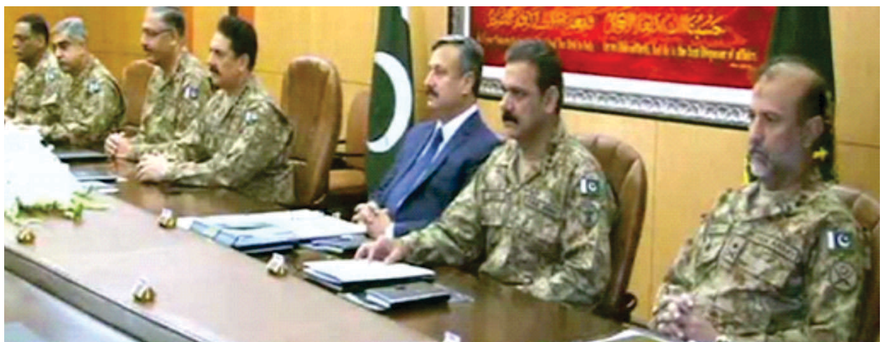
Representatives of the Military leadership at the civil-military huddle at the GHQ on June 07, 2016