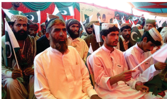
Militants who laid down their weapons under the Amnesty Package, announced by the Government of Balochistan waving Pakistan's flag during a ceremony held on August 14, 2015. The Chief Guest at the ceremony was the Commander Southern Command of the Pakistan 6 Army, Lt. Gen. Nasir Janjua