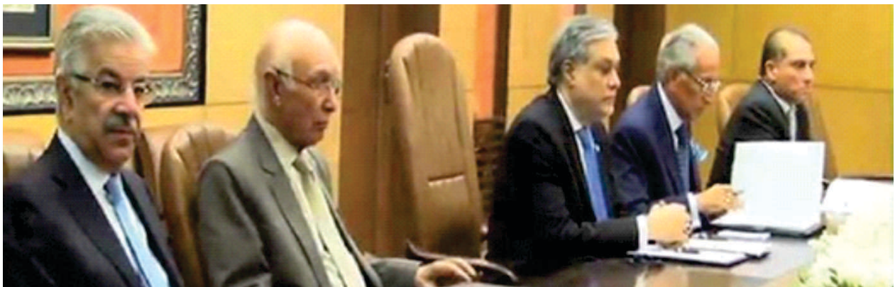
Representatives of the PML-N led Federal Government at the civil-military huddle held in the GHQ on June 07, 2016

Details of the foreign trips undertaken from June 2015-July 2016 during which he interacted with foreign political leadership are given in Table 4.