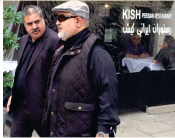
The Khan of Kalat met with the then- Senior Minister of the Provincial Government of Balochistan, Mr. Sanaullah Zehri, MPA, in London on August 14, 2015. This was reportedly the first official meeting between the estranged Baloch leader and representatives of the Government of Balochistan since the coalition Government formed after General Election 2013