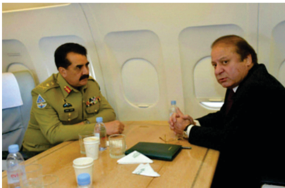
The Prime Minister and the COAS holding consultations on board Pakistan Air Force-1 before visiting Saudi Arabia on September 18, 2016. The Prime Minister was also accompanied by Special Assistant to the Prime Minister on Foreign Affairs, Mr. Tariq Fatemi, Principle Secretary to the Prime Minister, Mr. Fawad Hassan Fawad, and DG ISPR, Lt. Gen. Asim Bajwa

A comparison of the Prime Minister's and the COAS' meetings since the latter's appointment on November 27, 2013 is given in Figure 3.