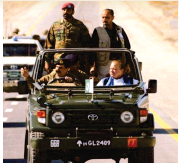
The Prime Minister being driven around by the COAS as they inspect the road developed in 13 Hoshab, Balochistan under the Pakistan-China Economic Corridor

In a curious case of complete disregard even for the right optics, for the 29 times the Premier met the COAS for the period under consideration, only two meetings of the NSC were held. It needs to be noted that 10 of these meetings (i.e. 34% of the total times they met) were one-on-one interactions between the Prime Minister and the COAS. The Federal Minister for Defence, Khawaja Muhammad Asif, MNA was present in only 6 of these meetings (21% of the total times the Prime Minister and the COAS met during June 01, 2015-July 31, 2016. On the other hand, the National Security Advisor to the Prime Minister (before October 22, 2015, Mr. Sartaj Aziz, and after that Lt. Gen. (Retd.) Nasser Khan Janjua) was present in 10 of these