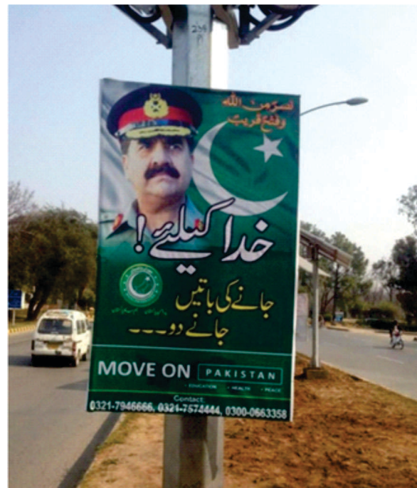
Following the COAS' statement, banners like the above crept up in Islamabad

Immediately following the COAS' public pronouncement, banners appeared across Islamabad, sponsored by the political party Move On Pakistan stating that ' Khuda kay liay.... Janay ki batain janay do! ' (Translation: For God's sake-Don't talk about going).